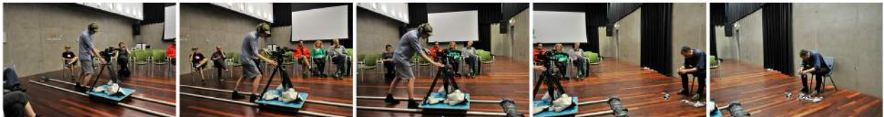
Jim Allen's News, 2014. Still photographs, 5 x 7".